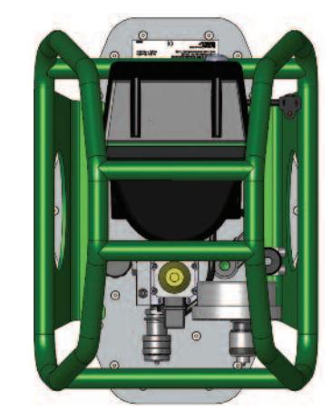
Shown with Cooling Option